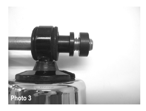
On 1991 - Later Sportsters also use one additional spacer in conjunction with the shouldered sleeve to provide sufficient space between the shocks and the Frame / Swing arm.

Install a shouldered sleeve as shown into each mounting eye of both shocks